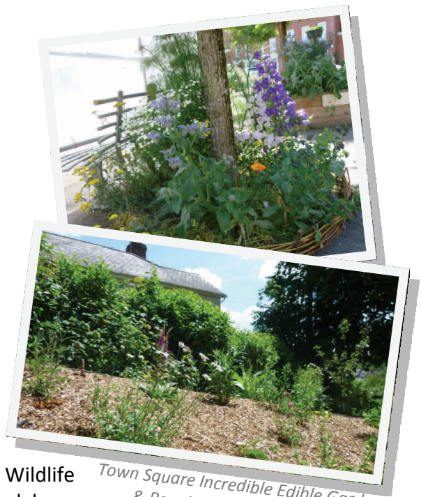
Town Square Incredible Edible Garden & Peoples Park Wildlife Area

As well as working on your own gardens, some of you have also been working on community gardens. This has included the Town Square Incredible Edible Garden, the Peoples Park Wildlife Area and the new three tier floral planters in the Town Square.